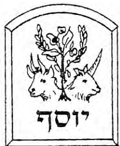
JOSEPH (Ephraim and Manasseh)

Joseph's family members would be people of might, resembling the horns of powerful animals of the highest choice. His two primary horns would be Ephraim and Manasseh. Hundreds of years later, when the tribes eventually left Egypt and migrated toward Canaan, they had already adopted their individual tribal standards.